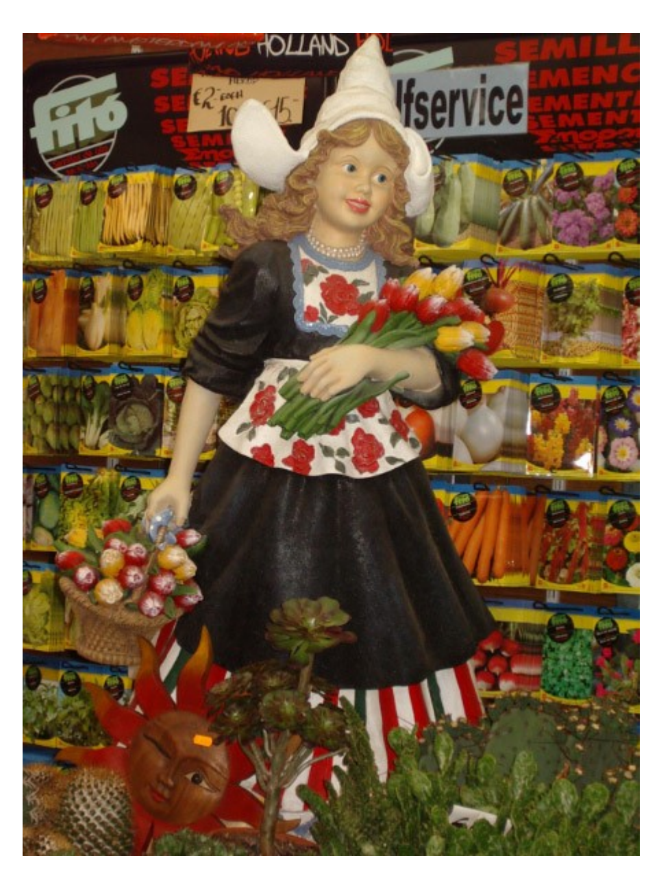
Our time in Amsterdam was far too short. One day we will have to go back and stay longer!